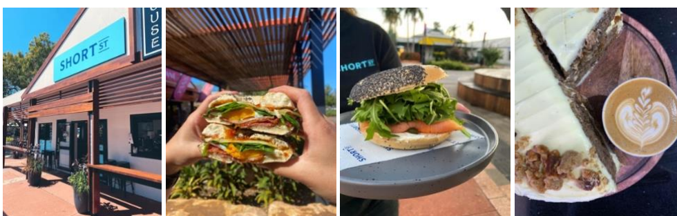
SHORT STREET CAFÉ

Located in Chinatown offering great coffee and all-day breakfasts. Dine in and takeaway. (08) 9192 3222