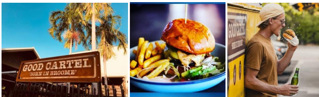
THE GOOD CARTEL

Drive through coffee and food, dine-in and takeaway located behind Sun Cinemas. Great burgers, breakfast, coffee and yummy rice bowls. Phone orders and pick up in drive through 0499 335 949