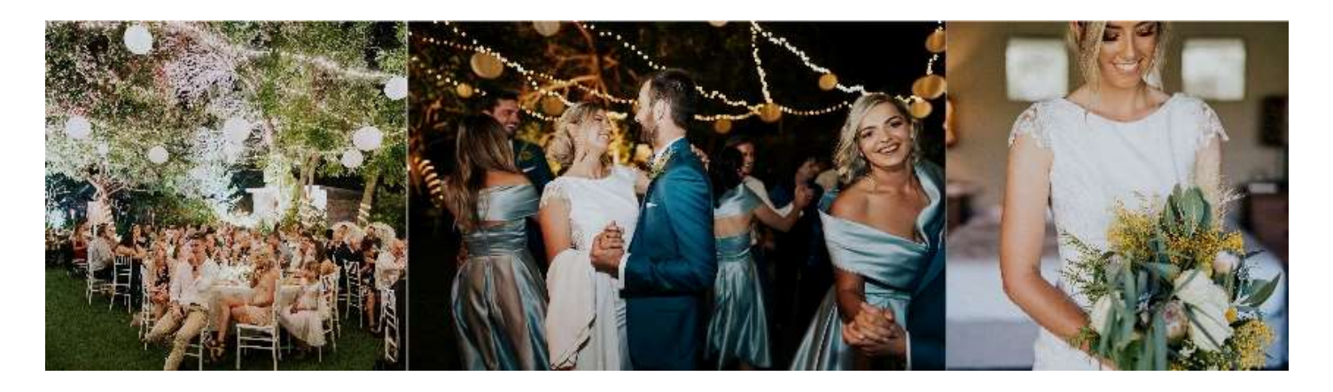
VENUE FEE AND WEDDING CONDITIONS

In order to confirm a date, we require a $5,500 non-refundable deposit to be paid within 4 weeks of confirming your reservation.